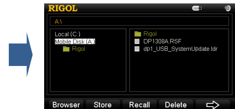
Store and Recall

You can store or recall the system setting parameters through internal (4 groups are available) or external memorizer. It will help you quickly save the current state of the instrument, or easily recall former setting parameters.