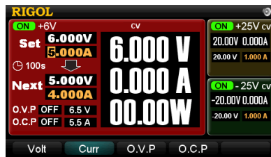
Enable Timing Output

The function is available to each channel, and up to 5 groups of outputs could be set for easy recall when needed.